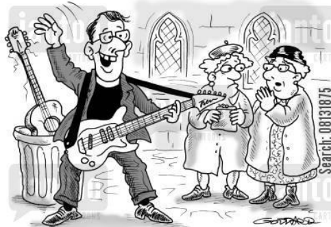
"I think the vicar's been radicalised."