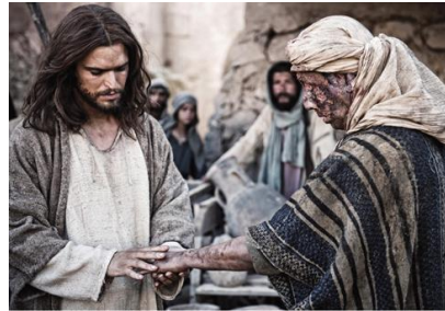
A Life Transformed